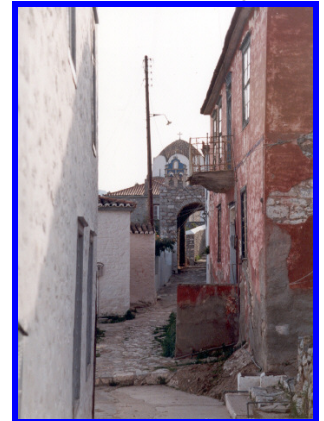
2 The Top Road