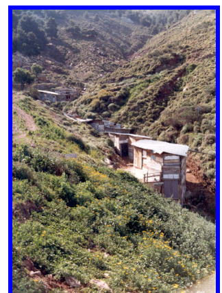
4 Donkey sheds