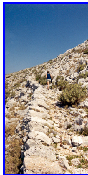
6 Going up the path flanking Mt Eros