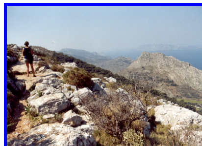
7 Looking back down the path