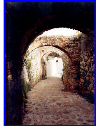
1 The arches (looking down)

Much of this path is across open mountainside. There is a drop down into a small valley and as you rise up you go into pine woodland. Continue upwards, through a col, until you come to the main ridge of the island which is marked by a signpost in Greek and English. From here there are glimpses through the trees down to the south coast of the island a thousand feet below.