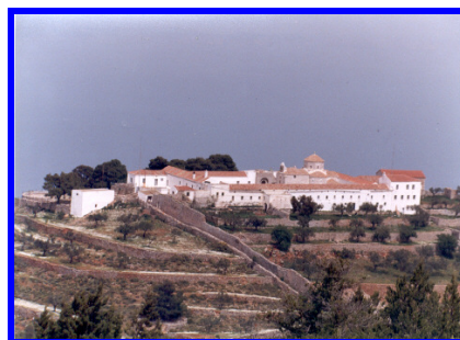
8 The monastery of Profitis Ilias