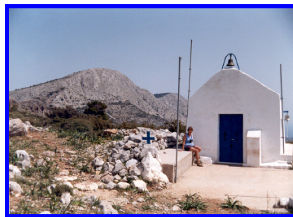
5 Agios Mamas with Mt Eros behind